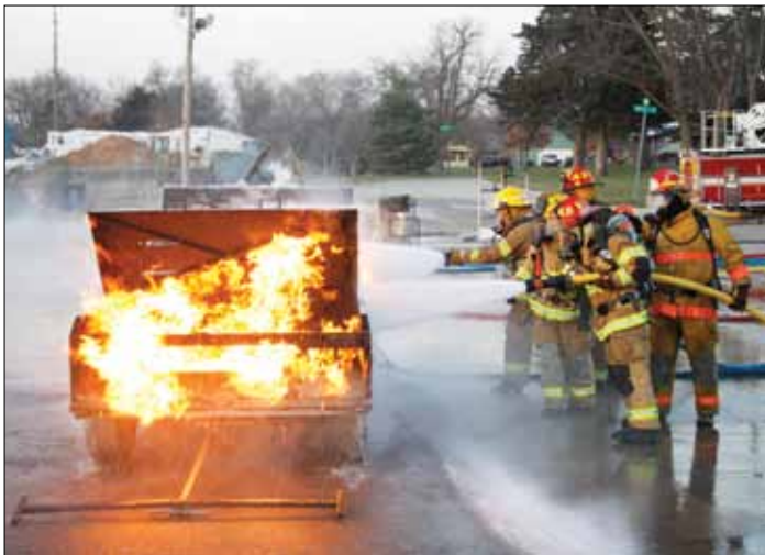
Firefighters work to extinguish a “car fire” as part of the training available using the Institute’s new Flammable Liquids & Gases Firefighting Simulator.