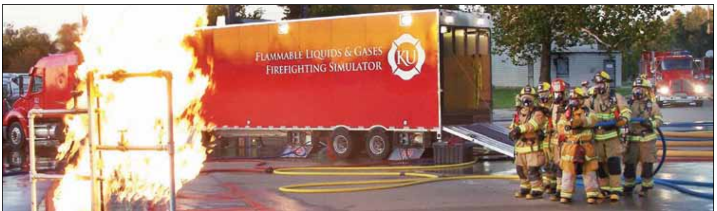
Firefighters prepare to extinguish a simulated propane leak and fire utilizing the Kansas Fire & Rescue Training Institute's Flammable Liquids & Gases Firefighting Simulator.