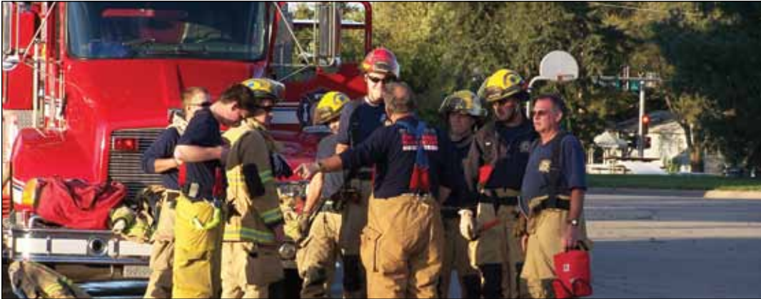
Firefighters from Wakarusa Township Fire Department prepare to take part in a live fire training exercise delivered by the Kansas Fire & Rescue Training Institute.

Preston Twp. Fire Dist. #6 Rainbows United, Inc. Ransom VFD Ransom Financial Consultants LLC Reading FD Reading Benefit Fire Dist. #1 Reno Co. EM Reno Co. Fire Dist. #4 Reno Co. Fire Dist. #7 Reno Twp. FD Richmond FD Riley City FD Riley Co. Fire Dist. #1 Rock Creek Twp. FD Rural Dev. Assoc. of NE Kansas Rural Fire Dist. #1 Rural Twp. FD Rush Co. Fire Dist. #5 Russell FD Sabetha FD Salina Airport Authority Salina FD Saline Co. EM Saline Co. Fire Dist. #2 Saline Co. Rural Fire Dist. #3 Saline Co. Fire Dist. #5 Saline Co. Fire Dist. #7 Satanta/Dudley Twp. FD Scandia FD Scott Health & Safety Scott City FD Scott Twp. Fire Dist. #5 Scranton FD Sedan FD Sedgwick Co. Fire Dist. #1 Sedgwick Co. Sheriff's Dept. Sedgwick FD Seward Co. FD