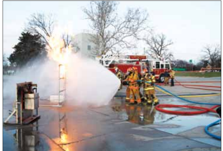
The pilot delivery of the new Handling Propane Emergencies course was held in Lawrence and involved firefighters from Wakarusa Township Fire Department and Lawrence-Douglas County Fire Medical Department. Firefighters work to control a leak and fire on a prop designed to simulate a pipe leak and fire.

City of Overland Park Public Works City of Shawnee City of Topeka Civil Air Patrol Claflin Fire Dist. #1 Claflin PD Clark Co. FD Clay Center FD Clearwater FD Clinton Twp. FD Clyde FD Coffeyville Comm. College Coffey Co. Fire Dist. #1 Coffeyville FD Coffeyville Resources LLC FD Colby FD Columbus FD Concordia Fire/EMS Dept. Conway Springs FD Copeland FD Council Grove FD Cowley Co. Fire Dist. #2 Cowley Co. Fire Dist. #3 Cowley Co. Fire Dist. #4 Crawford Co. EMS Crawford Co. Fire Dist. #1 Crawford Co. Fire Dist. #2 Crawford Co. Fire Dist. #4 Cullison Twp. Fire Dist. #9 Cunningham FD Decatur Co. Rural Fire Dist. #1 Delia Fire Dist. #5 Derby FD De Soto FD Directorate of ES Dodge City FD Doniphan Co. Fire Dist. #1 Douglas Co. Sheriff's Office Downs FD Durham Fire Dist. #1 Easton Twp. FD Edna VFD El Dorado FD Elkhart FD Ellinwood FD Ellis Co. RFD Ellis FD Ellsworth VFD Emporia FD Ensign FD Enterprise FD EPCO Enterprise Products Erie FD