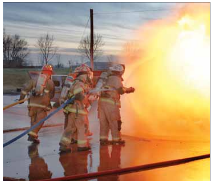
Firefighters make their approach on the "residential propane tank" prop. This prop is one of the scenarios included in the Flammable Liquids & Gases Firefighting Simulator delivered to the Institute in June of 2009.

Through the activities listed in this section, two of the top five courses identified in our strategic plan were implemented last year and four of the top six programs identified in that plan have been implemented.