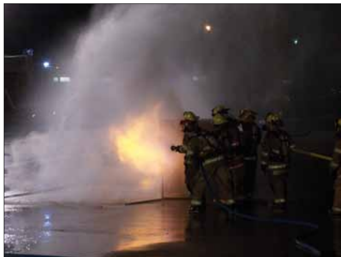
Three different configurations of propane cylinders and tanks are included in the new Flammable Liquids & Gases Firefighting Simulator. Here firefighters experience a fire involving a 100 lb propane cylinder.

With the current economic conditions in Kansas and our country, the Institute continues to maintain a conservative fiscal posture. Adequate funding is still available to continue our services; however, with the economic forecasts predicting no improvement, the Institute will continue to protect our ability to deliver training to the point that financial realities allow.